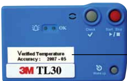
TL30V certification label